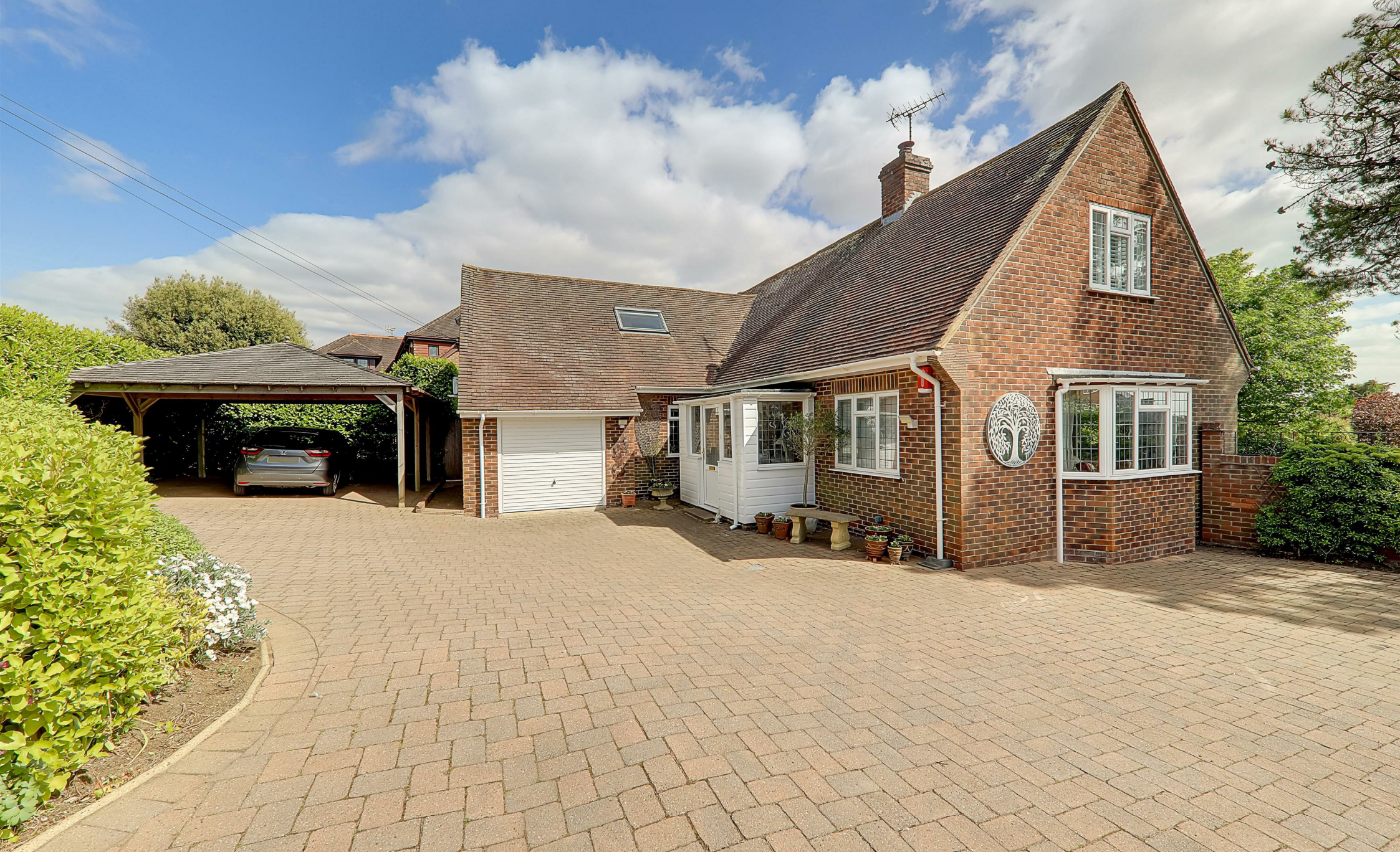
13 Broadview Gardens, High Salvington, Worthing, BN13 3DZ Guide Price £850,000